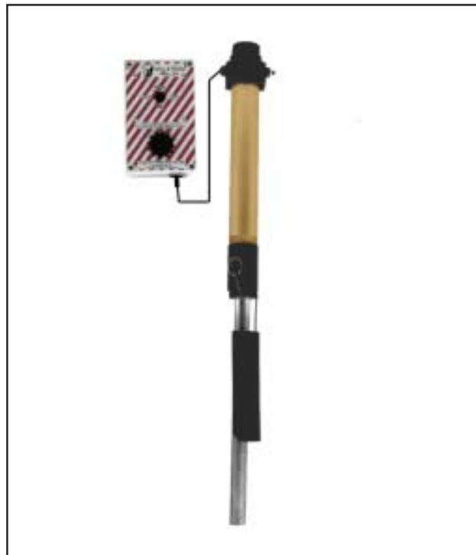
1228 C&B 3X4 With Alarm